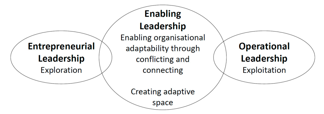
Figure 1. The model of leadership for organisational adaptability. Adapted from: (Uhl-Bien and Arena 2018).

from providing detailed descriptions of the ways how leaders enable the adaptive process, that is, how adaptive space is created and sustained. This work aims to address this issue by studying the ways by which enabling leaders create adaptive spaces, and engage the conflicting and connecting processes in practice, using the management consulting industry as the object of analysis. It employs a qualitative research design to identify enabling leadership practices and to enrich and extend the theoretical model introduced by Uhl-Bien and Arena (2018).