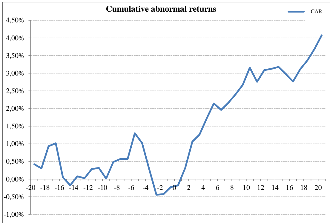
Figure 1: Cumulative abnormal returns of target stocks.

This figure plots the excess returns 20 days prior up to 20 days after the announcement date. There is a run-up of about 3% in between day 10 and day 2 prior to the filing. These returns continue to increase and there is an overall 4% in 20 days with minor fluctuations. Several hedge funds prefer to make public announcements before the official announcement date, whereas other hedge funds launch aggressive activism only after the filing date. In these cases, the filing date could not be an accurate proxy for the event date when activism becomes first publicly known.